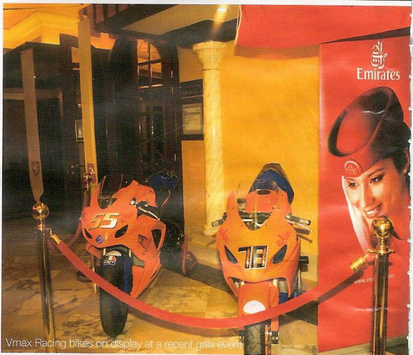
Vmax Racing bikes on display at a recent gala event

Make sure to watch the guys from Vmax Racing and the other teams next season, fighting for crucial points each and every raceday.